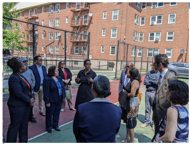
June 2022 - HUD leaders from Washington D.C., New York Regional Office, and Newark Field Office joined Jersey City Housing Authority, City of Jersey City, and local partners to launch Region 2's Our Way Home's Day of Action at Holland Gardens in Jersey City, New Jersey.