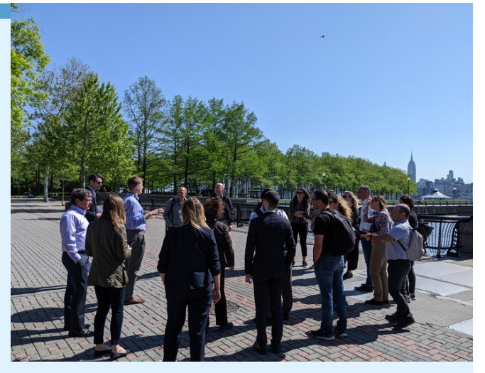
May 2022 - HUD HQ and field office leaders, State of New Jersey, and City of Hoboken exchanged climate resilience practices with two international delegations and shared highlights of the $230 million post-Hurricane Sandy <u>Rebuild by Design</u>-Hudson CDBG-DR project