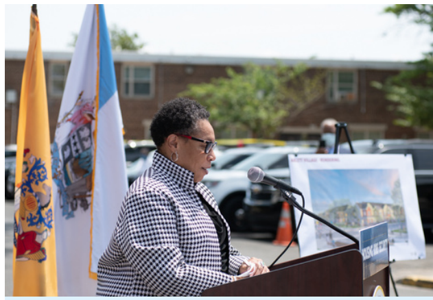
June 2021 - Secretary Fudge announced a $35 million Choice Neighborhoods Implementation Grant for the Cramer Hill neighborhood in Camden, NJ

<u>City of Newark</u> and <u>City of Jersey City</u> joined the House America initiative